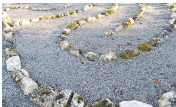
MEADOW LABYRINTH KETTLEWELL CHURCHYARD